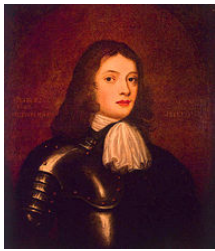
William Penn as a young man

William Penn grew up a child of privilege and comfort in England in the 1600's. Like many adolescents, he argued with his parents, had significant conflict with his father. His parents sent him away to school and while